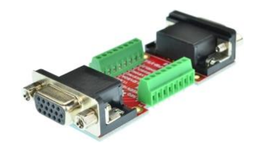
Figure 4: D15HD-F-F-V1A with terminal blocks

Caution!! When assembling the D15HD-F-F-V1A, please make sure you place the connector on the right side.