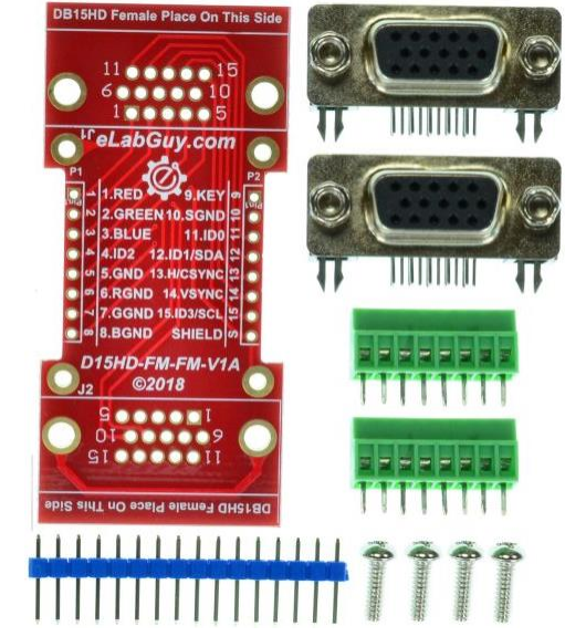
Figure 1: Parts inside the kit (Note: the module is not assembled, user can decide which connector to use on the module.)